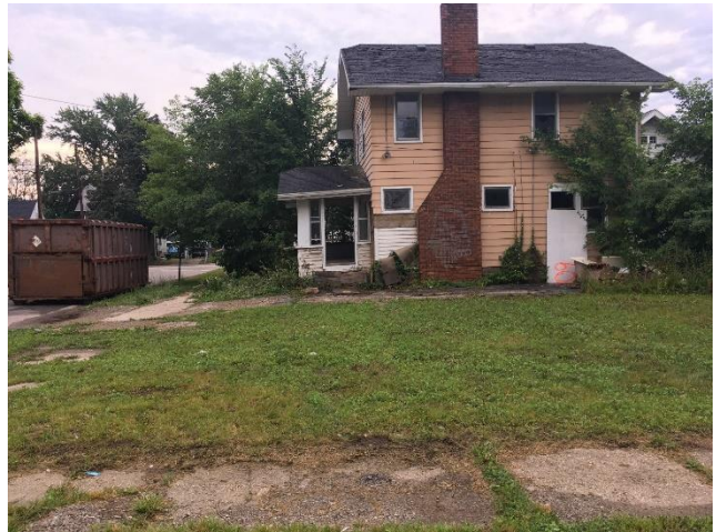
Figure 1: 1909 Becker Street

First house to be inspected was at 1909 Becker Street in Flint (Figure 1). This site was scheduled for demolition on this day (12/July) there was a dumpster placed in front of the residence but no contractors were onsite. We visited several properties in different phases of deconstruction. Some properties were just abated (Figure 7) the asbestos siding and the interior plaster walls had been removed and placed (per neighbors) in a dumpster marked for asbestos that was placed in front of the residence on (Brown street).