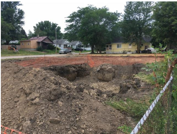
Figure 9: 3106 Grand Traverse one week after demolition 20 July