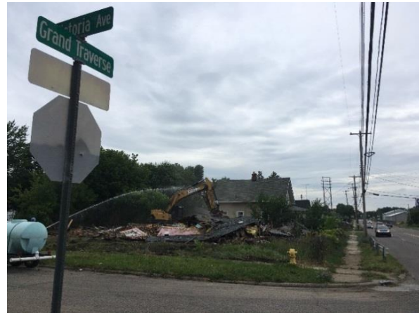
Figure 8: 3106 Grand Traverse knocked down