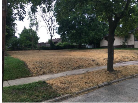
Figure 4: Another site on Caldwell completed and seeded