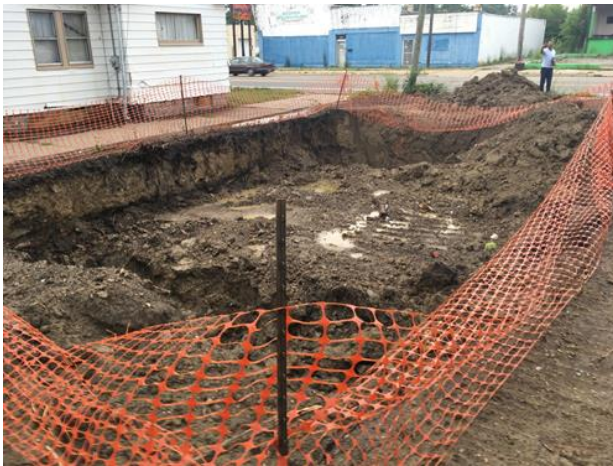
Figure 2: Site on Corunna awaiting backfill

At a site on Corunna (Figure 2) the residence had been demolished and all the debris had been removed. A clean hole (with no debris or remnants of the basement) was all that remained. We visited several sites in Flint on Caldwell (Figure 3 and 4), Lyons, Swayze, Brown and Becker (Figure 1) streets in different phases of demolition. On Swayze one had a hole similar to Corunna (Figure 2) and had one property that was completed with the ground leveled covered with clean fill that was seeded with a straw cover. We visited a couple more completed sites and a couple more that had open holes.