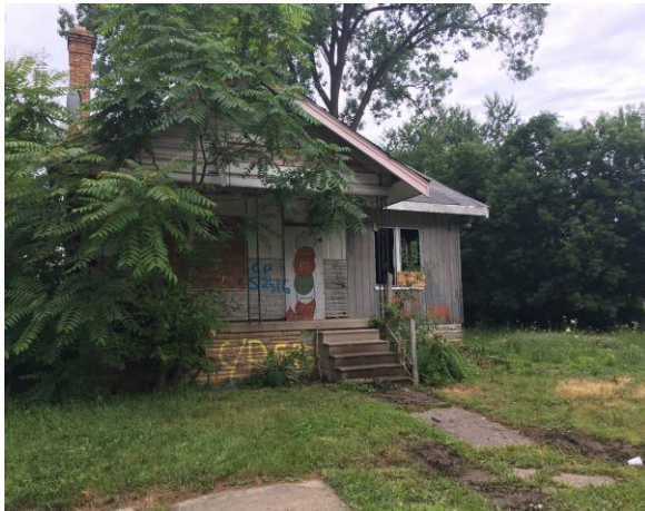
Figure 5: House on Concord awaiting demolition