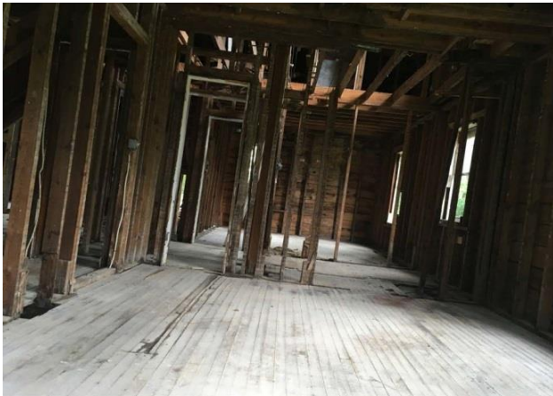
Figure 7: 3106 Grand Traverse abated interior prior to demolition