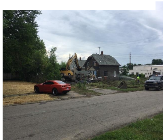
Figure 6: Completed Lot of 3106 Grand Traverse