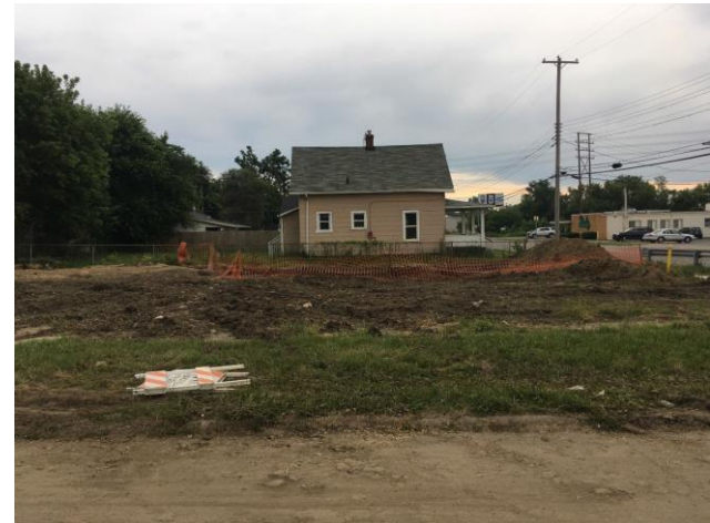
Figure 10: 3106 Grand Traverse 20 July Basement awaiting backfill