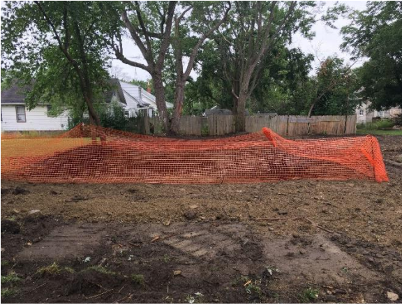
Figure 3: House on Caldwell awaiting backfill